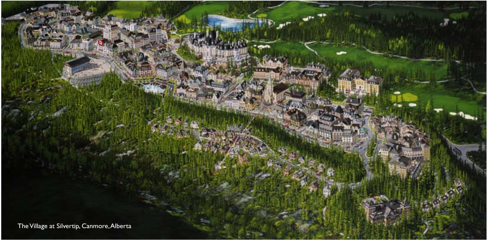
The Village at Silvertip, Canmore, Alberta